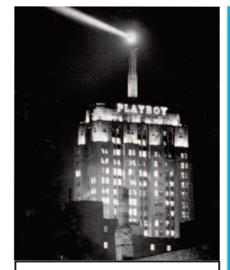
BLOOD MOON APPLIES THE TABLOID STANDARDS OF TODAY TO THE REPRESSION, RAGE, MENDACITIES, AND HEARTBREAK OF THE SEXUAL REVOLUTION DURING "THE AMERICAN CENTURY"

"For more information, click on the "OUR BOOKS" tab of BloodMoonProductions.com for access to a videotaped book trailer and the soundtrack of a recent radio interview from THE JUNOT FILES describing the premises, scope, and ambitions of this astonishing new addition to Blood Moon's BABYLON series."